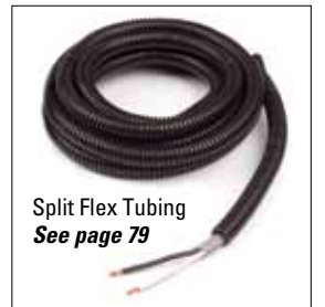
Split Flex Tubing See page 79