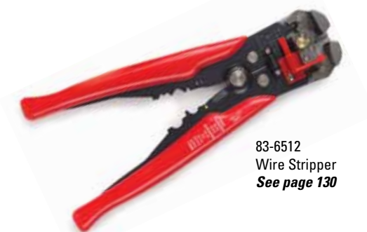
83-6512 Wire Stripper See page 130