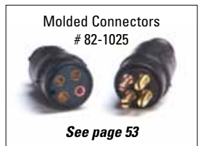
Molded Connectors # 82-1025