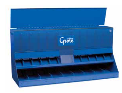
Top loading lid eliminates re-stocking hassles