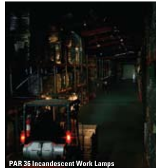
PAR 36 Incandescent Work Lamps