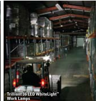
Trilliant 36 LED WhiteLight™ Work Lamps