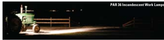
PAR 36 Incandescent Work Lamps