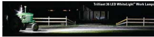
Trilliant 36 LED WhiteLight™ Work Lamps