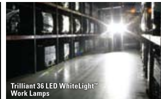
Trilliant 36 LED WhiteLight™ Work Lamps