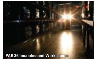
PAR 36 Incandescent Work Lamps