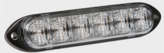
98341 / 98342 / 98343 / 98344 / 98345