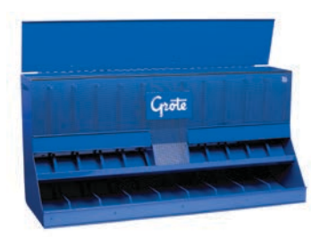
Top loading lid eliminates re-stocking hassles

The Grote Wire Dispenser provides a unique, compact and effective inventory management solution for spooled wire.