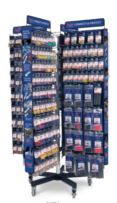
The popular 01061 automotive display features products for lighter duty as well as some heavy duty products.