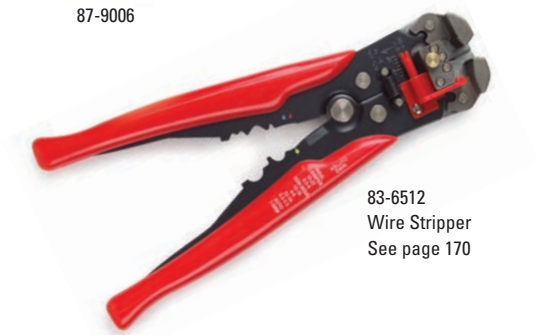
83-6512 Wire Stripper See page 170