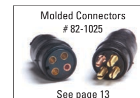
Molded Connectors # 82-1025