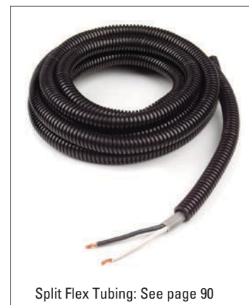
Split Flex Tubing: See page 90