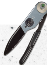
83-6516 – Four-Indent Crimp

To ensure the best possible connection, Grote recommends you use the right tool for the best connection possible. Grote offers the following two Deutsch tools.