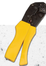
83-6517 – Two-Indent Crimp

* For a full listing of DT and DTM series terminals and connectors refer to Grote's Electrical Connections & Accessories catalog (pages 24 & 25) and visit us anytime, anywhere at www.grote.com