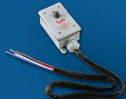
AUTOMATIC OVERRIDE SWITCH WITH TIMER (44360)