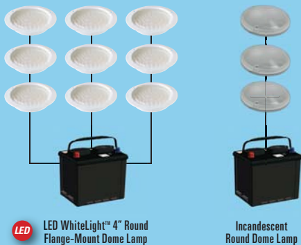
Illustration based on Grote LED WhiteLight™ 4" Round Flange-Mount Dome Lamp pulling .5A each, versus an Incandescent Round Dome Lamp pulling 1.44A each.

Grote's LED WhiteLight™ interior lamp will last 50,000 hours vs. the rated life of a fluorescent bulb (12,000 hours) or the rated life of an incandescent bulb (300 hours)