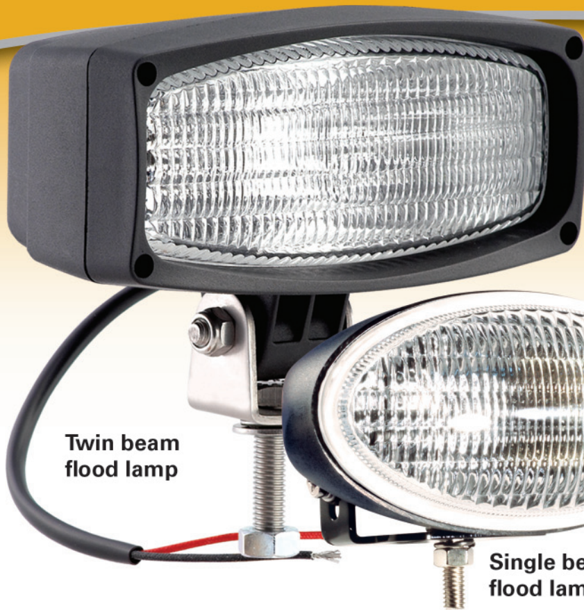
Twin beam flood lamp